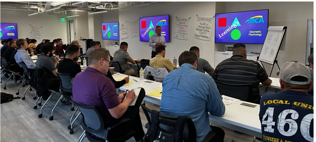
Industry professionals training at the CPMCA Facility in downtown Los Angeles